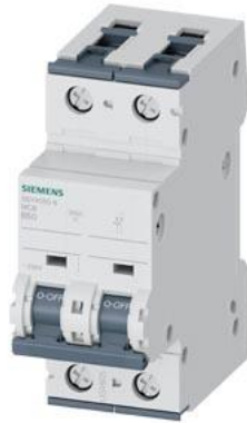
Miniature circuit breaker 230 V 10kA, 1+N-pole, B, 50 A, D=70 mm