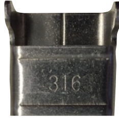
Type L Buckle