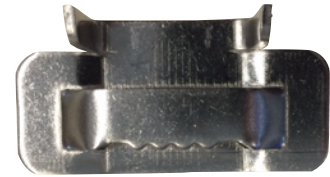
Type E Buckle