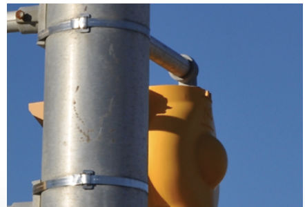
Sign and Signal