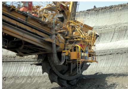
Mining and Minerals