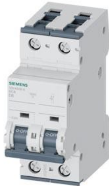
Miniature circuit breaker 230 V 10kA, 1+N-pole, D, 8A, D=70 mm