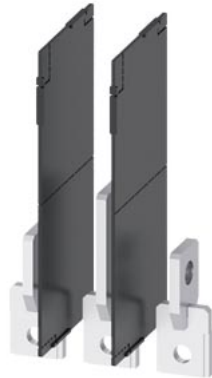
bus connector extended edgewise; 3 units accessory for: 3VA20/21/22