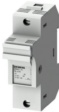
SETRON, cylindrical fuse holder, 14x51 mm, 1-pole, In: 50 A, Un AC: 690 V, LED signal detector