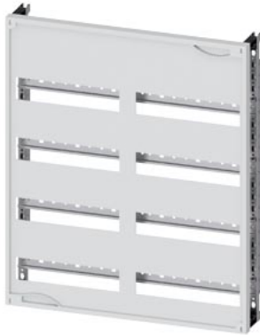
ALPHA 400 DIN quick assembly kit for modular installation devices tier spacing 125 mm with N/PE bar, H=600 W=500