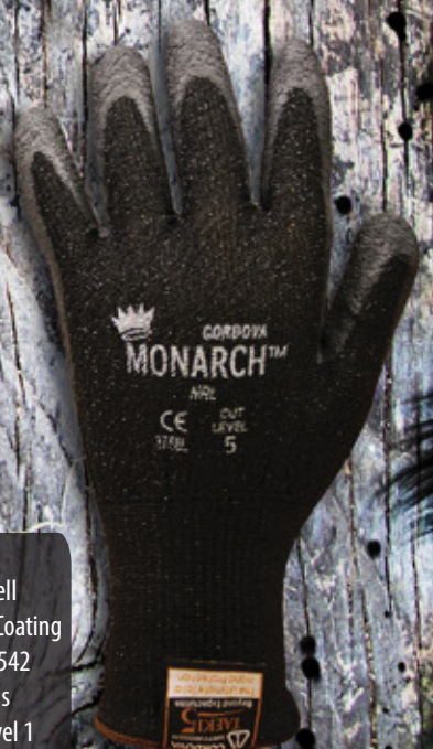
3758 Monarch™ NRL --13-Gauge, Black Taeki5® Shell --Black Natural Rubber Palm Coating --CE Cut Level 5, CE/EN 388: 3542 --ANSI Cut Level 3, 1264 grams --CE/EN 407: Contact Heat Level 1 --Sizes: XS-XL