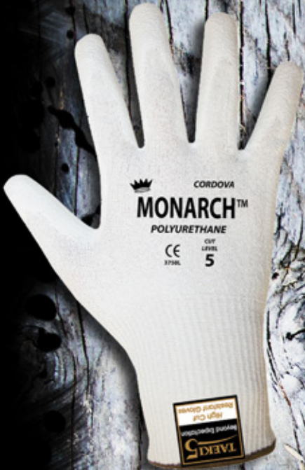
3750 S-XL White Shell White PU