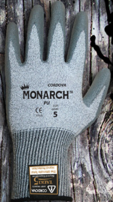
3751 XS-2XL Gray Shell Gray PU

Taeki5® Properties --CE Cut Level 5/Minimum ANSI Cut Level 3 --Abrasion and Contact Heat Resistant --Multiple Shell Weights and Colors --Multiple Coating Options --Easy to Launder --Unaffected by Chlorine Bleach & UV Light