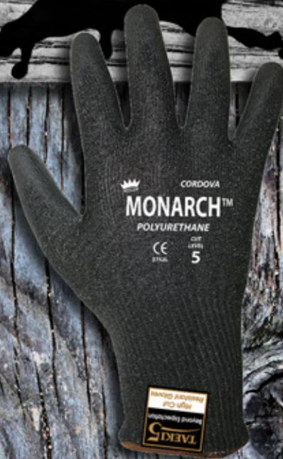
3752 Monarch™ PU --13-Gauge, Black Taeki5® Shell --Polyurethane Palm Coating --CE Cut Level 5, CE/EN 388: 4542 --ANSI Cut Level 3, 1021 grams --CE/EN 407: Contact Heat Level 1 --Sizes: XS-2XL