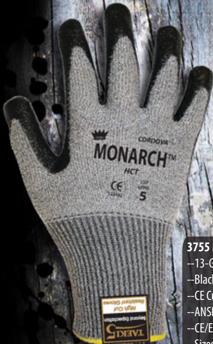
3755 Monarch™ HCT --13-Gauge, Gray Taeki5® Shell --Black HCT-Nitrile Palm Coating --CE Cut Level 5, CE/EN 388: 4542 --ANSI Cut Level 3, 1033 grams --CE/EN 407: Contact Heat Level 1 --Sizes: S-XL

Taeki5® Properties --CE Cut Level 5/Minimum ANSI Cut Level 3 --Abrasion and Contact Heat Resistant --Multiple Shell Weights and Colors --Multiple Coating Options --Easy to Launder --Unaffected by Chlorine Bleach & UV Light