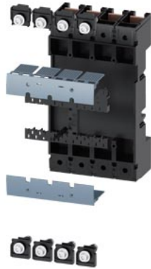
plug-in unit complete kit accessory for: circuit breaker, 4-pole 3VA63