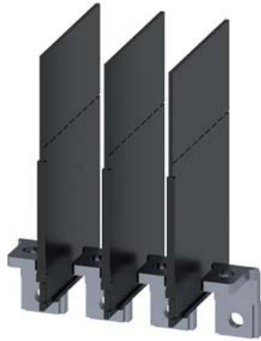
nut keeper kit right-angled; 4 units accessory for: 3VA10/11