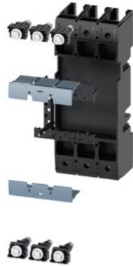
plug-in unit complete kit accessory for: circuit breaker, 3-pole 3VA20/21/22