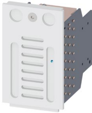
Accessory Circuit breaker 3WA, Arc chute, AC 690 V frame size 1