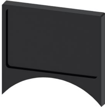
Label holder, 30 mm, flat, Frame rounded off at the bottom black, for labeling plate 17.5 mm x 27 mm, for gluing