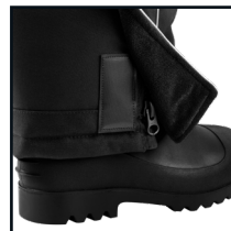
(Hook & Loop Leg Openings)