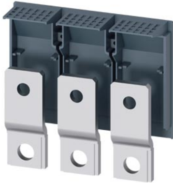
bus connector extended front 3 units accessory for: 3VA6 150/250 3VA5 250