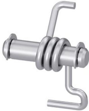
Accessory circuit breaker 3WA, Automatic reset of the reclosing lockout