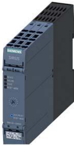
MOTOR STARTER SIRIUS 3RM1 REVERSING STARTER 500 V; 0,1-0,5 A; 24 V DC PUSH-IN CONNECTION SYSTEM