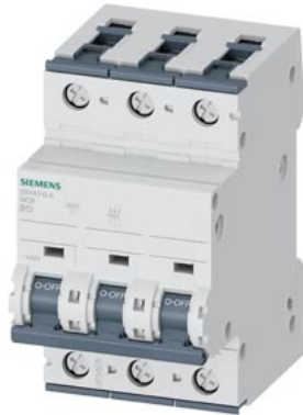
Miniature circuit breaker 400 V 10kA, 3-pole, B, 13 A, D=70 mm