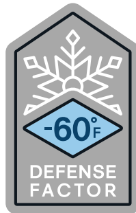
(Temperature Rating: Down to -60° F)