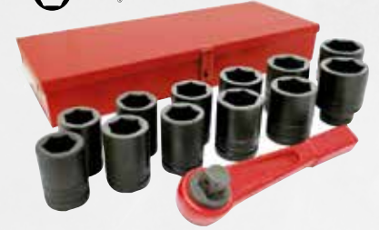
1" drive SAE deep impact socket set with impact handle