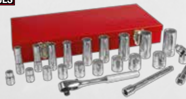
SAE 12-point, 3/8" drive standard and deep sockets with accessories