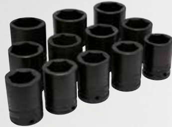
1" drive SAE 6 point deep impact sockets