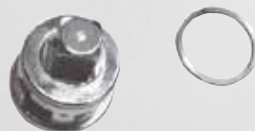
For round head