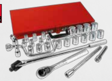
SAE 12-point, 1/2" drive sockets with accessories