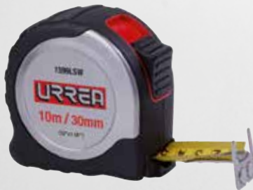
Stainless steel measuring tape