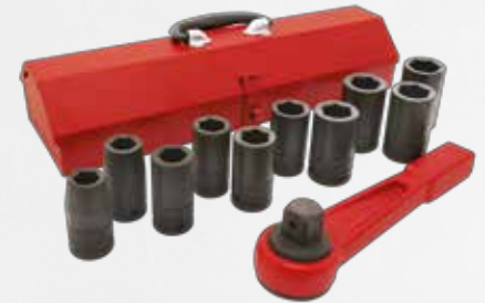
3/4" drive SAE deep impact socket set with impact handle