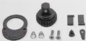
For Quick Release