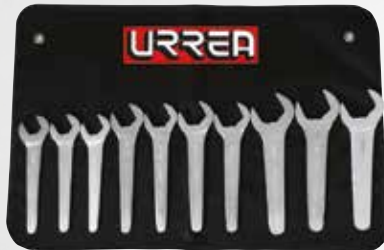
Metric service wrenches