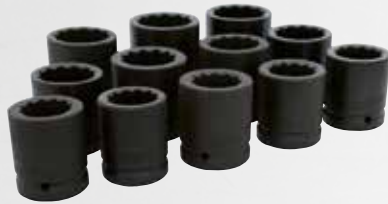
1" drive SAE 12 point impact sockets