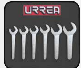
Metric service wrenches