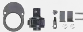
For Quick Release