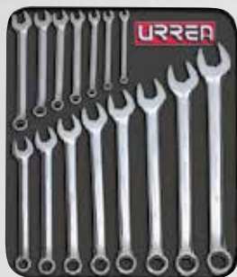
SAE combination wrenches