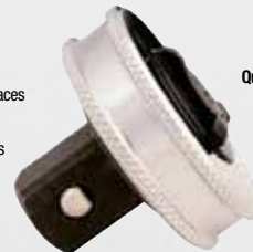
Quick Release system

To tighten or loosen nuts and bolts quickly