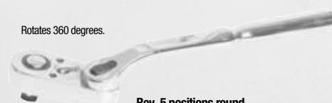
Rev. 5 positions round