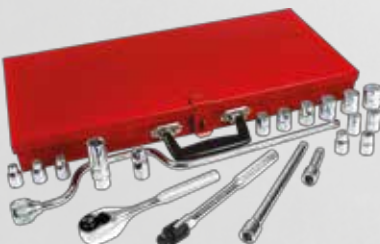
Metric 12-point, 3/8" drive sockets with accessories