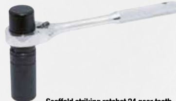
Scaffold striking ratchet 24 gear teeth