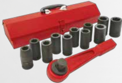
3/4" drive Metric deep impact socket set with impact handle