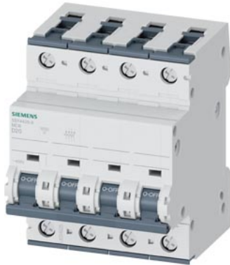
Miniature circuit breaker 400 V 10kA, 4-pole, D, 20 A, D=70 mm