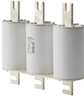
SITOR fuse link, with slotted blade contacts, 3 x NH3L, In: 2100 A, aR, Un DC: 1250 V, front indicator