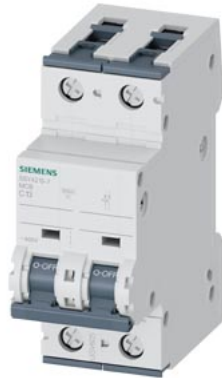
Miniature circuit breaker 400 V 10kA, 2-pole, C, 13 A, D=70 mm