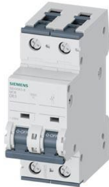
Miniature circuit breaker 230 V 10kA, 1+N-pole, D, 63 A, D=70 mm