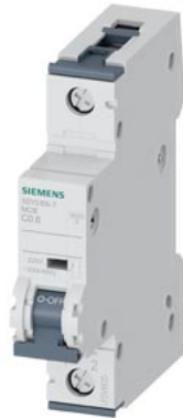
Circuit breaker Universal current 220 V DC 230/400 V AC 10kA, 1-pole, C, 06A