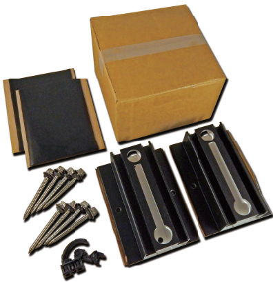
RT-[E] Mount kit