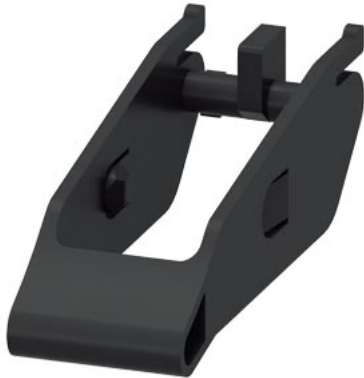
Fixing/reject bracket for plug-in relay RT series