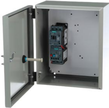
STARTER, 3RE41226CA114CY0, WITH MODS